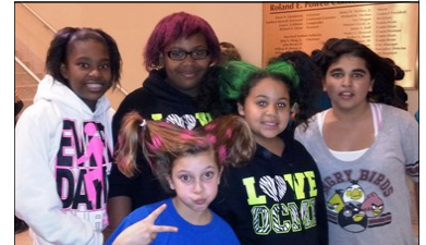
Students from Monocacy, Crestwood and Ballenger attended Alive 2011

In October, a new Campus Life M launched in the Ballenger Creek area, increasing the territory, the volunteer team and the student population reached. It has been a huge success. These two clubs are serving 138 kids in two locations with 18 volunteers.