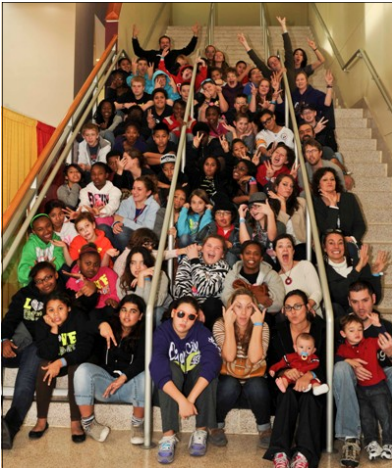
Alive Draws 73 From CMYFC This Edition: The Great I Am Seen Through The Eyes of YFC

Phone: 301-663-0561 Fax: 301-663-8980 E-mail: yfc@yfcm.org Web: www.yfcm.org