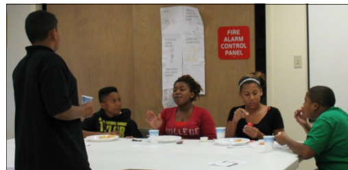
Taking time to eat and share at Campus Life

don't even realize it. They have a moment in time when life is talked about, no judgment made, just listening ears to the Word of God. When they come for food and drink they are fed. When they come to Campus Life they are fed